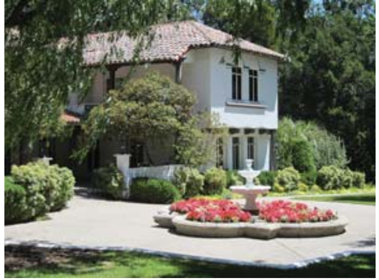
Hacienda de las Flores hosts many events around the fountain.